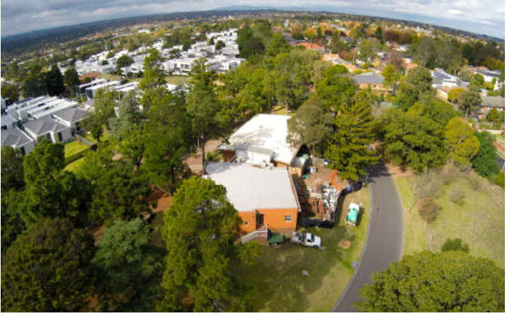
What are they trying to hide now ?