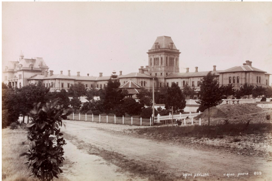
Extract from The Melbourne Leader Oct 1885, plus Stage 8 view of Morrison's improved 'Main Drive' approach to the Kew Asylum. 1890 , (C.Rudd. State Library of Victoria)

Of all the public gardens in the neighborhood of Melbourne, it may be safely said that those of the Kew Asylum are the best managed. The soil having been properly prepared, the trees and shrubs allowed sufficient space, their growth has been highly satisfactory. Since our previous visit in January, 1881, when they had just got fairly into growth after being about five years planted, from small trees and bushes they are now large and handsome specimens, their beauty of form being equally as striking as the size they have attained. On the front