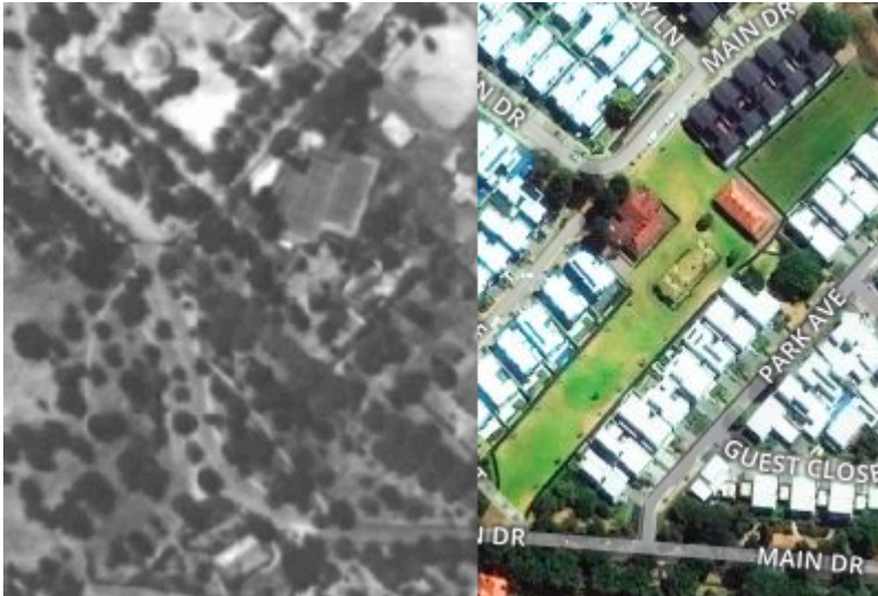
Comparing Aerial Photos of Main Drive, Oak Walk, and Stage 8 Parkland flown 1945 and 2012 Link: http://1945.melbourne

1945 Morrison's Heritage Parkland survives the War.