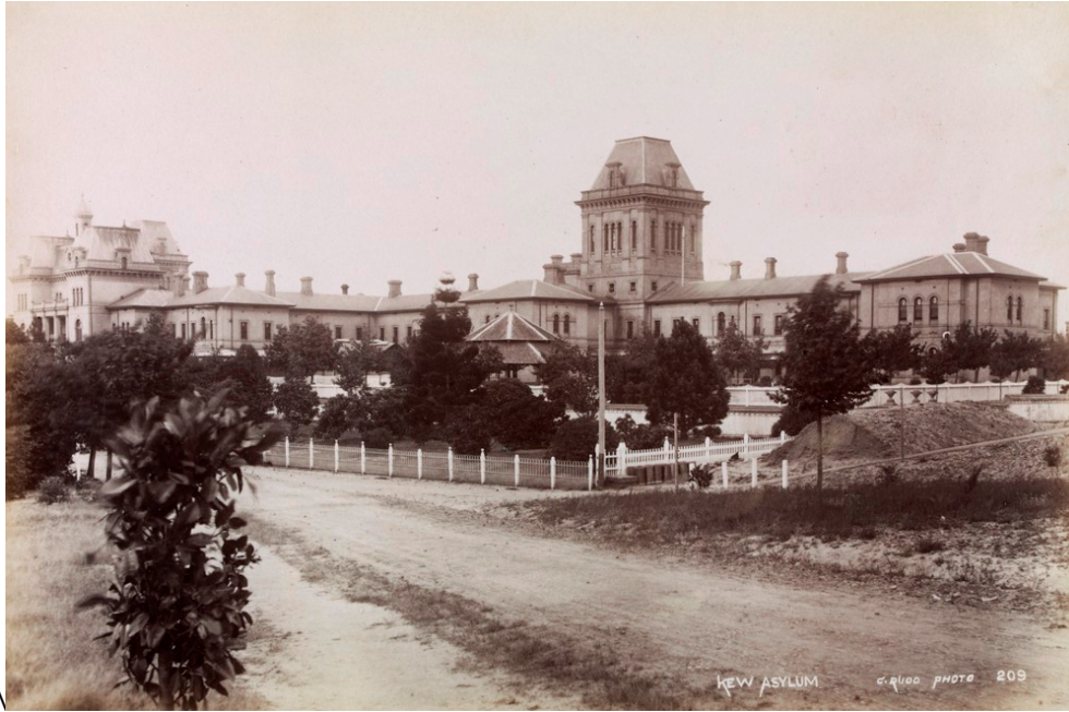
Main Drive 1890