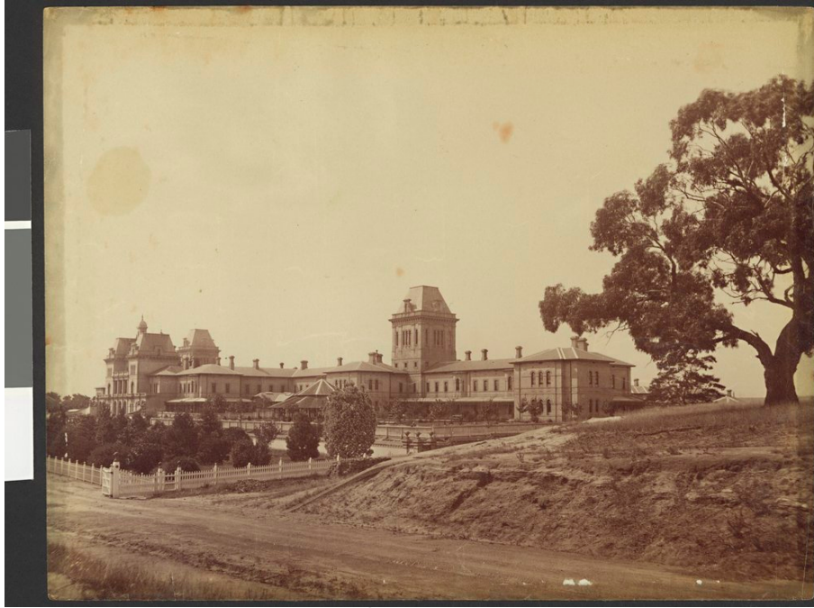
Extract from The Melbourne Leader 1881, plus Stage 8 view of the Entrance to the Kew Asylum via Oak Walk in 1878

The 1878 photograph by John Lindt (above) shows the original line of approach to the Kew Asylum laid out along what is now Oak Walk when the Asylum opened in 1875.