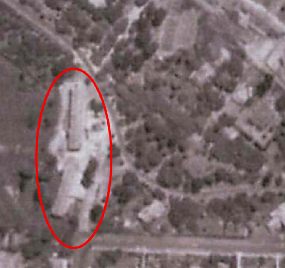
Willsmere and Kew Cottages Nurses Hostel adjacent to Stage 8.

The Government returned this land to Yarra Bend Park in order to protect panoramic views and provide a buffer zone between Willsmere and future residential development.