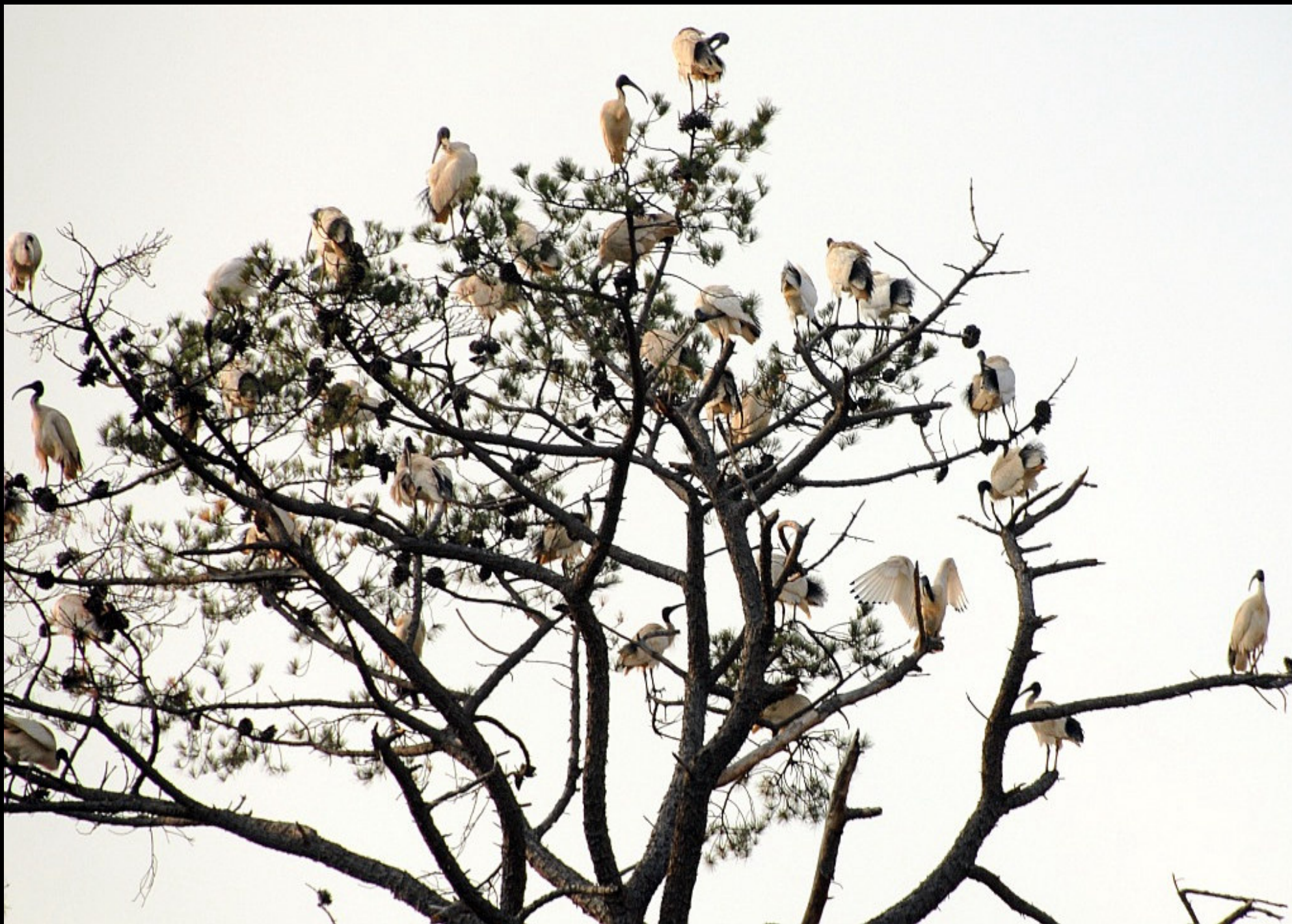
This in Tree 42 Kew Cottages November 2007