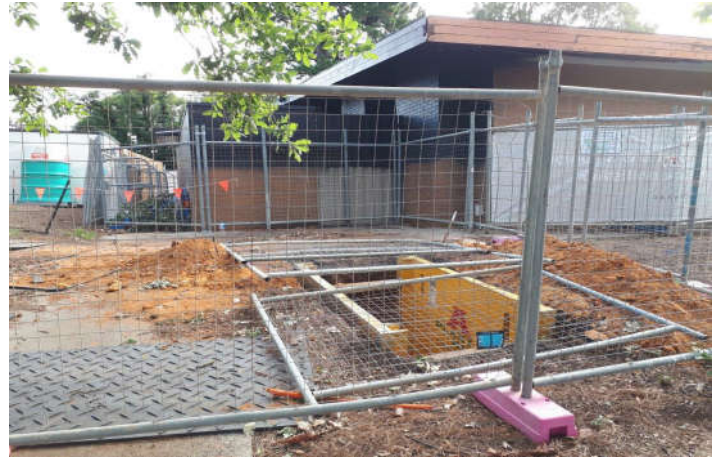
The Developer appears to have started work once again without satisfying Heritage Permit conditions for the proposed apartments.