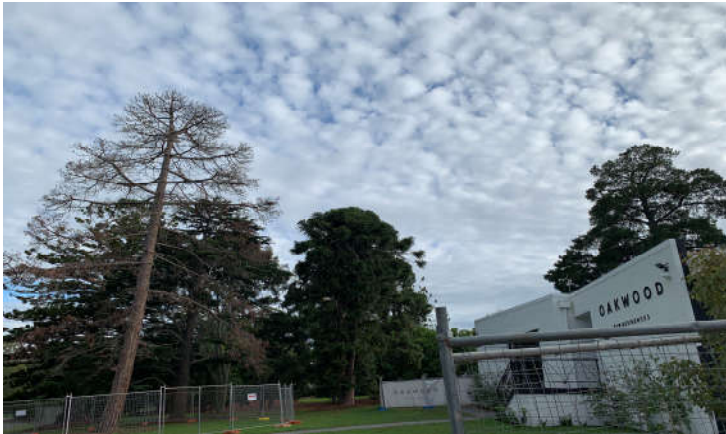
Heritage Canary Island Pine next to Oakwood Sales Office. The tree appears to have started to die after unauthorised excavations last year