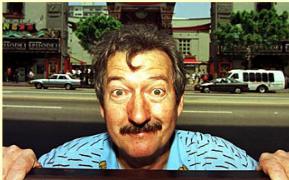
Darryl Kerrigan: The Castle.